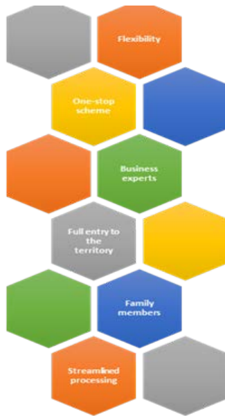
Figure 1. Key considerations of the Spanish startup scheme